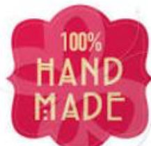
HAND MADE ITEMS FOR ALL AGES