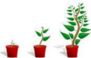
GROW PLANTS FOR THE GARDEN STALL