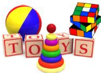
GOOD QUALITY TOYS