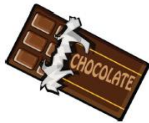
LARGE CHOCOLATE BLOCKS