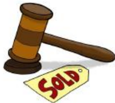
SILENT AUCTION ITEMS & BUSINESS SPONSORS