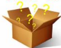
SMALL ITEMS FOR KIDS LUCKY DIPS