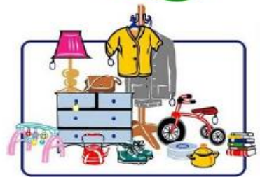
GOOD QUALITY PRELOVED ITEMS