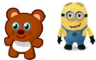
STUFFED SOFT TOYS