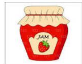
HOME MADE JAMS, CHUTNEYS, PRESERVES ...