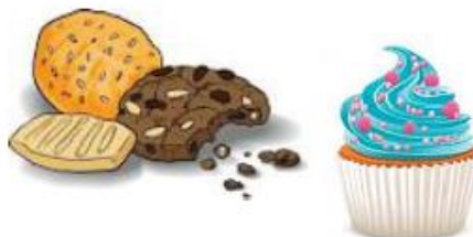
CAKE & BISCOTTI BAKERS AT FETE TIME