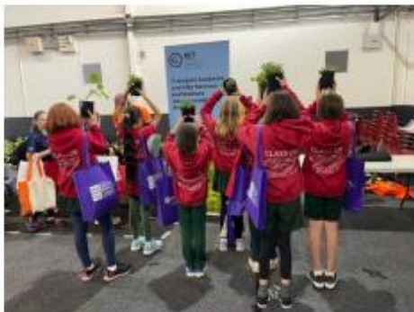
Smiles, 5/6 Teaching Team

Keep up the fantastic work Years 5 and 6. We are all so proud of how hard you've been working so far this term!