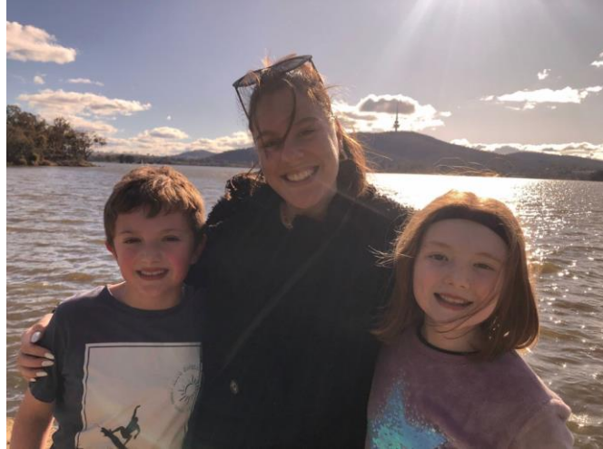
This is a photo of me with my host family in Yarralumla!

Being a teacher has always been my dream. I was lucky enough to have an amazing teacher when I was little that really encouraged me and saw something in me that even I didn't see, being a teacher like her is what I aspired to be.